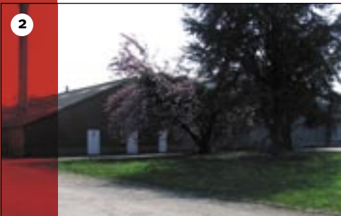
2. The Freeze-drying factory.