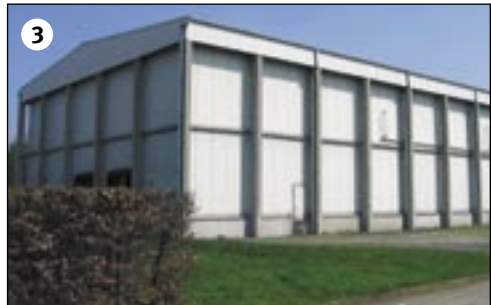
3. The cold storage for the deep-frozen herbs.