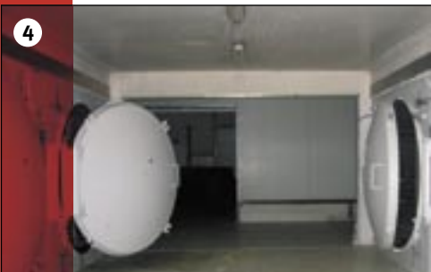
4. Room with a freeze-drying unit.