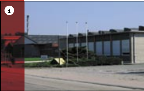
1. VNK/Lyobel in Hulshout.

Freeze-drying is an industrial method that has been used to conserve edibles and medicines. The principle of freeze-drying is that through low temperatures (minus 30 or 40 degrees Celsius) the water molecules are being absorbed into ice-crystals. This way, the air will become extremely dry and water will be extracted from the product. This process is based on sublimation: direct transition from solid matter to vapour. Freeze-drying edibles preserves the taste better, reduces the volume and weight of the product and the product can be kept longer. An other great advantage of freeze-drying is the fact that micro-organisms, like bacteria, cannot live in an atmosphere without water. This way, the product is being preserved better. Freeze-dried products are: soups, tea and instant coffee.